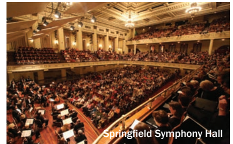
Springfield Symphony Hall