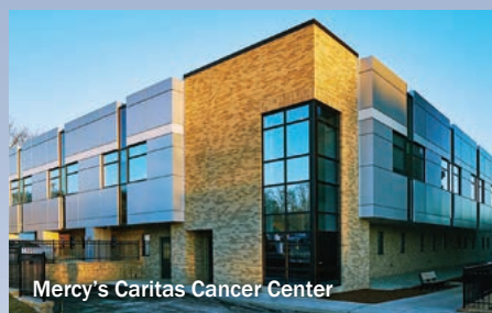
Mercy's Caritas Cancer Center

resource to the Community. Mercy Medical Center is committed to offering the highest quality of health care services and provides a broad range of programs and services from adult psychiatric inpatient care to women's health to cancer treatments at the new Sister Caritas Cancer Center.