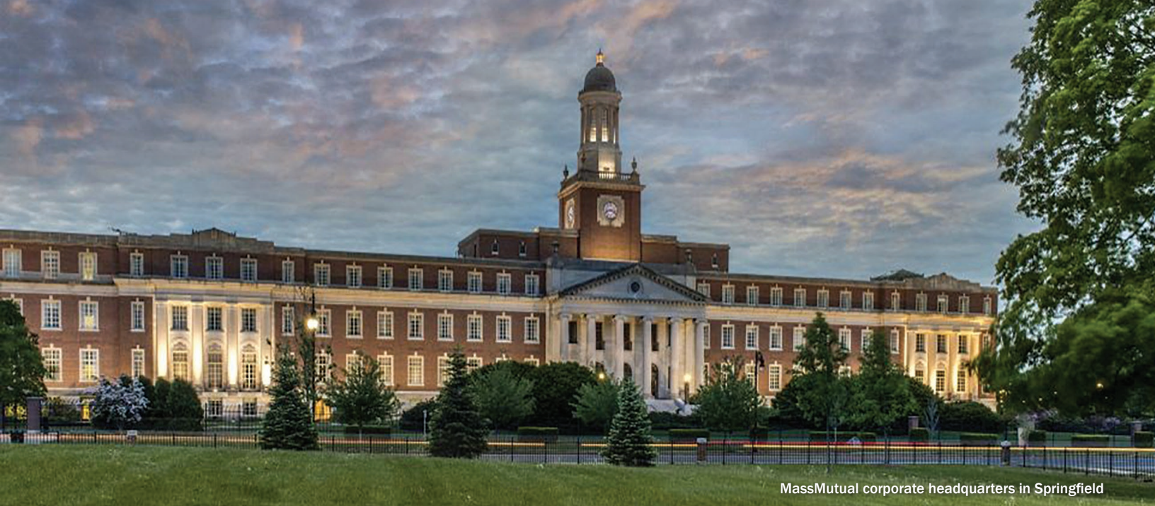
MassMutual corporate headquarters in Springfield