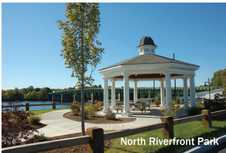
North Riverfront Park

The Connecticut River Walk and Bikeway includes 3.7 miles along the Springfield riverfront which provides outstanding opportunities to bike, run, walk or rollerblade in view of stunning scenic vistas of the Connecticut River, the Springfield skyline and Memorial Bridge. The path also links to the Pioneer Valley Riverfront Club which offers a host of river based sporting activities. www.pvriverrfront.org