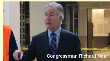
Congressman Richard Neal

Haven starting in 2018, and serves as a regional hub for both intercity and intracity bus services. The facility is expected to play host to approximately 5 million passengers a year.