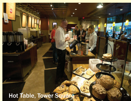
Hot Table, Tower Square