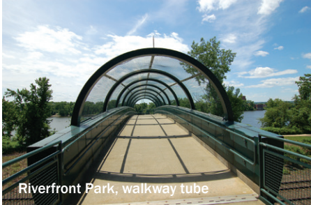
Riverfront Park, walkway tube

Springfield isn't just a City packed with plenty to do indoors; it is also a place where green spaces are everywhere offering more than 35 different sizes and types of parks, recreational and open spaces, including the vast 735-acre Forest Park . At Forest Park on the banks of the Connecticut River. Visitors can enjoy using the ample tennis courts or opt for a scenic paddle boat ride on the 31-acre Porter Lake. Other activities include bird watching spots, miles of walking trails and one of the finest small zoos in New England.