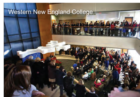
Western New England College

Since its inception in 1919, Western New England College has been an active participant in the life and history of our community. Through the years, the university has collaborated with many organizations and businesses