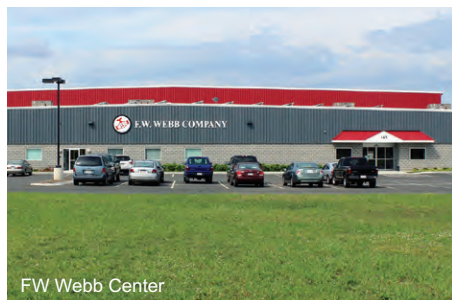
FW Webb Center

Springfield Smith & Wesson Industrial Park is home to the world headquarters of Smith & Wesson, Performance Food Group, and a brand new regional FW Webb Center, which opened in 2013 after a $6 million investment. The park has been developed by the Springfield Redevelopment Authority and includes one remaining developable parcel.