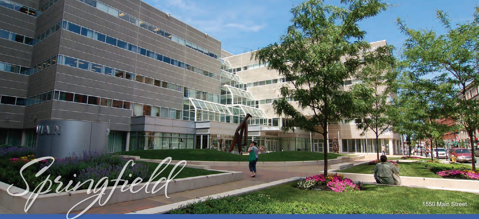
1550 Main Street