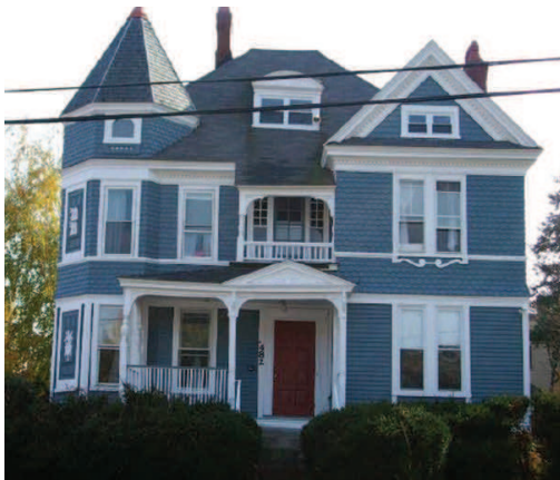
Pegasus House (females, age 18-25) Psychological Center Lawrence, MA 1-978-687-4257