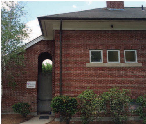
Spectrum Young Adult Residential (males, age 18-25) Spectrum Health Systems Westborough, MA 1-508- 898-1570