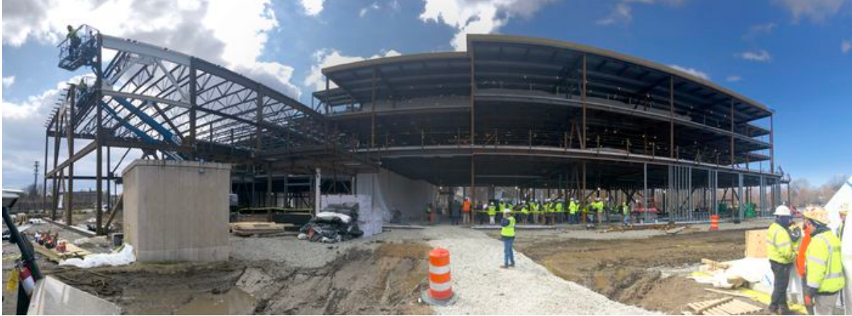
Brightwood-Lincoln Elementary Schools, under construction 2020