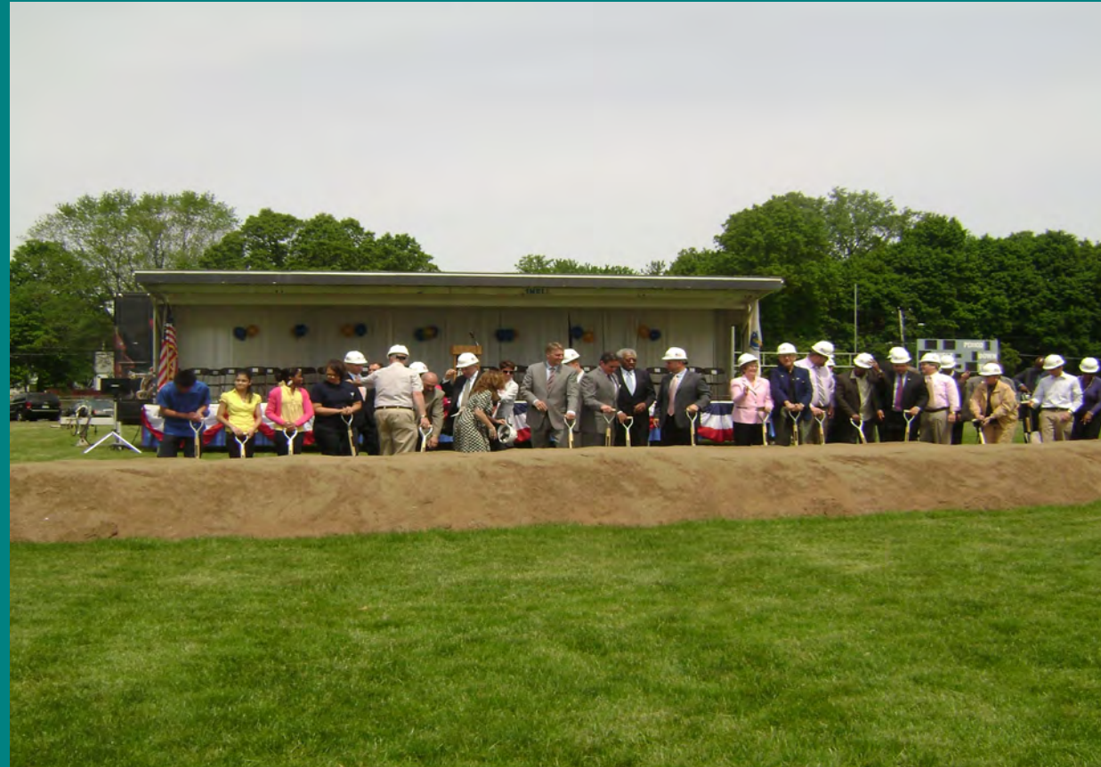
Photo: Ground breaking ceremony for the New Putnam trade school