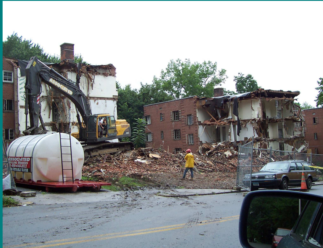
Photo : In progress the demolition of Buildings in the long hill gardens complex as part of the density reduction, increased green space, revitalization and renovation of the remaining buildings.