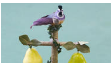
'12 Days of Christmas' Tops $107K In 2012