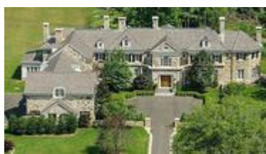
Greenwich Neighborhood Among Nation's Top 10 Most Expensive