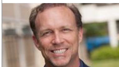
Who's Climbing Connecticut's Career Ladder?