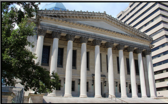
SPRINGFIELD CITY HALL