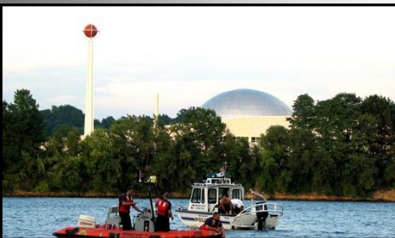
WATER SEARCH & RESCUE