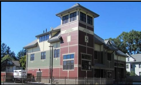
WHITE STREET STATION