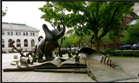
DR. SEUSS MUSEUM