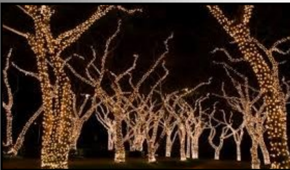
FOREST PARK, BRIGHT NIGHTS