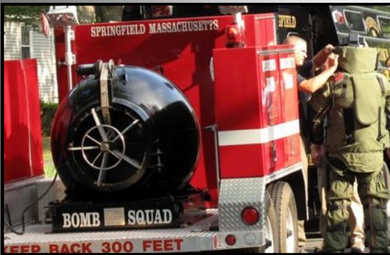
ARSON & BOMB SQUAD