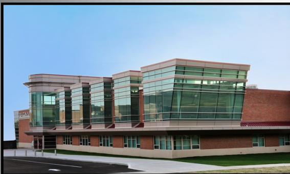
ROGER L. PUTNAM VOCATIONAL — TECHNICAL HIGH SCHOOL