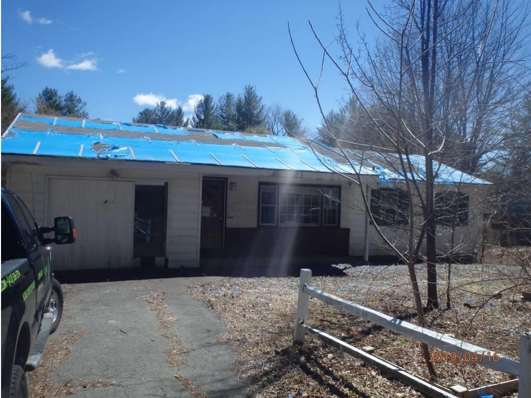
870 East St, Lenox MA - Representative exterior photos showing deteriorated roof, make shift wall over garage door and damaged siding.